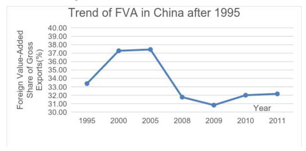
Figure 6: Trend of FVA in China after 1995